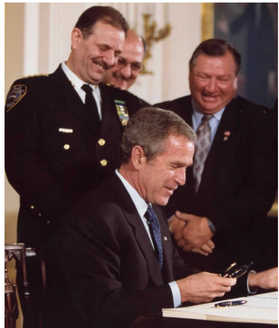
Columbus Day is a federal holiday often celebrated with a White House ceremony. Here President George W. Bush congratulates Italian American leaders on Columbus Day 2003.