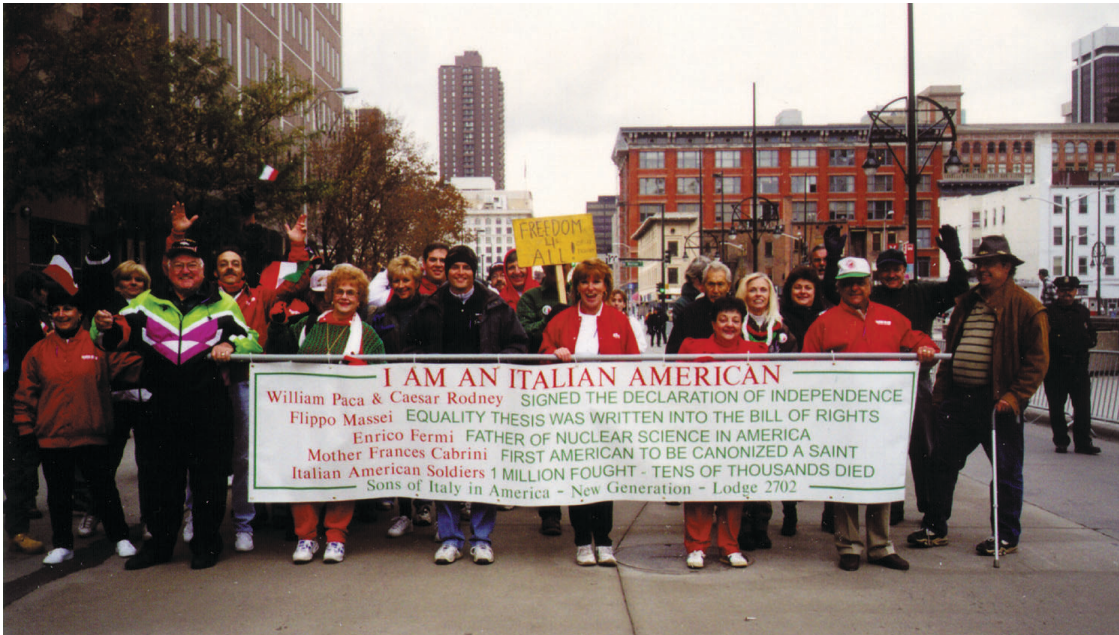
Italian Americans like these in Denver, Colorado, celebrate their heritage on Columbus Day with parades and festivals.