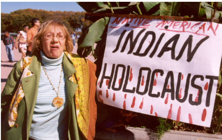
Activists like this one at a recent Columbus Day Parade in Chicago blame Columbus for actions that happened long after his death in 1506.