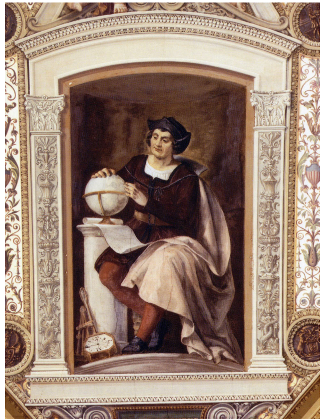
Christopher Columbus-Discovery by Constantino Brumidi (1859). The fresco is one of a dozen images of the great Italian explorer that adorn the U.S. Capitol building.